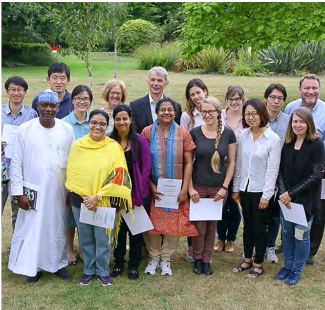
Delegates and tutors from the 2015 International Publishing Summer School

Oxford International Centre for Publishing Studies, UK