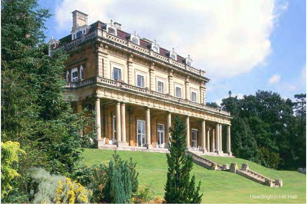
Headington Hill Hall